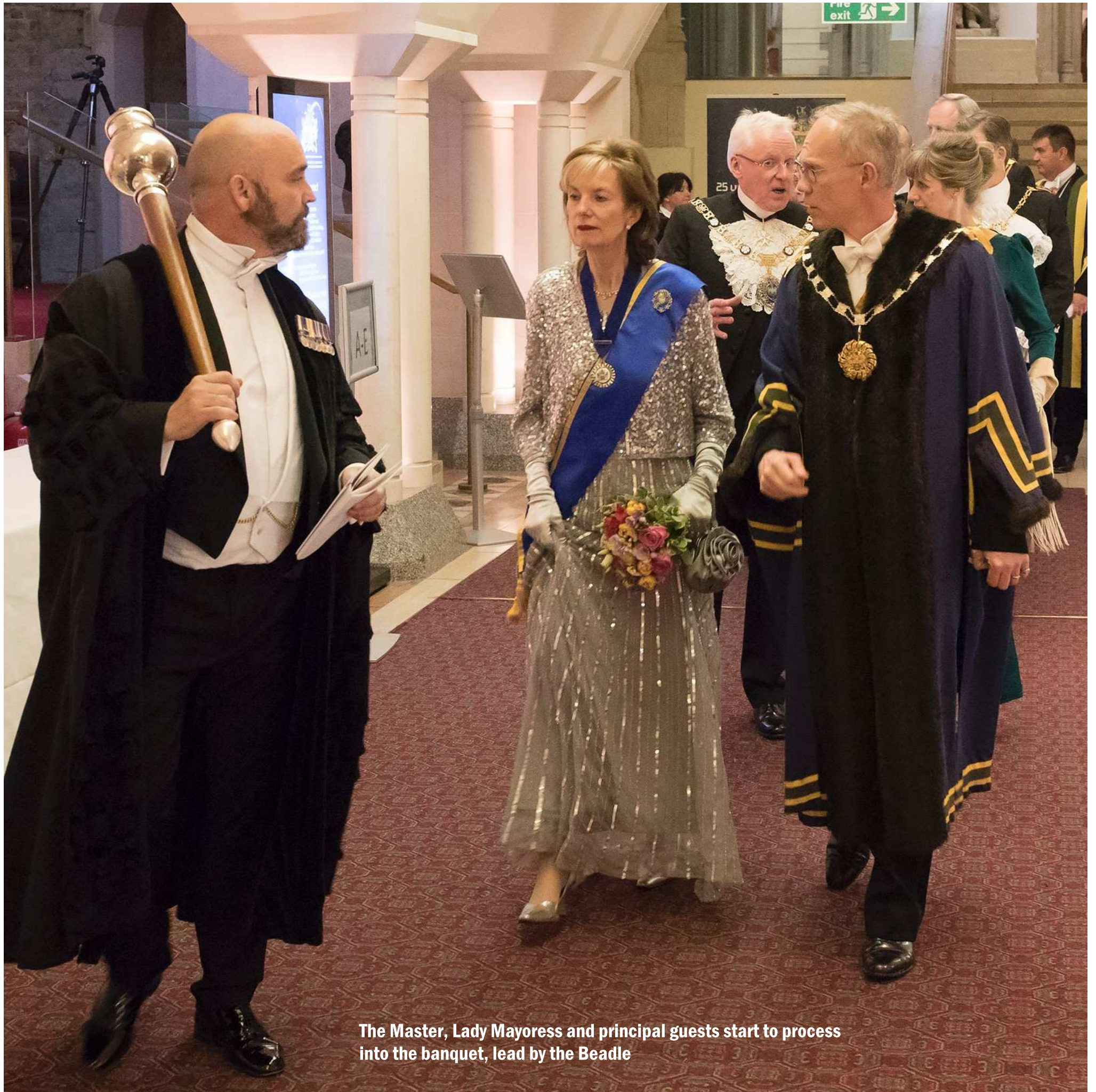
The Master, Lady Mayoress and principal guests start to process into the banquet, lead by the Beadle